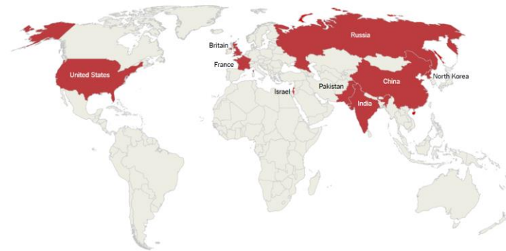
Countries with nuclear weapons

By The New York Times |Source: Federation of American Scientists